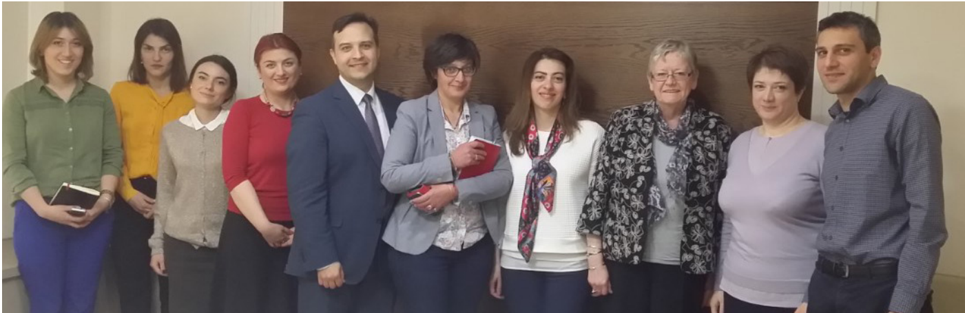
Our consultants and project partners in Georgia

We are delighted to be awarded some interesting new projects this year, in Armenia, Georgia and Lesotho, and – a first – a framework project under the CSSF (Conflict, Stability and Security Fund). Under the Local Governance Programme implemented by GIZ in Armenia, our consultants will provide support to the Ministry of Territorial Administration and Development in improving the national training system for local government officials. In Georgia, under a contract with UNDP and in collaboration with GEC Corporation, Georgia, our consultants will provide support to the Government of Georgia in implementing the new Law on the Civil Service through training and coaching in managing change. In Lesotho our consultants will support the Ministry of Development Planning in developing the National Human Resources Development Policy to build a skilled, productive and professional workforce. And we are delighted to have won our first assignment for the CSSF framework contract. This will be support for the Overseas Territories in legislation reform and legislative drafting. We look forward to working with our partners in all these countries.